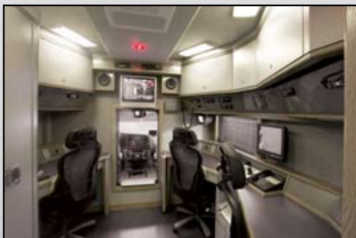
Command area with pass through to the cab.