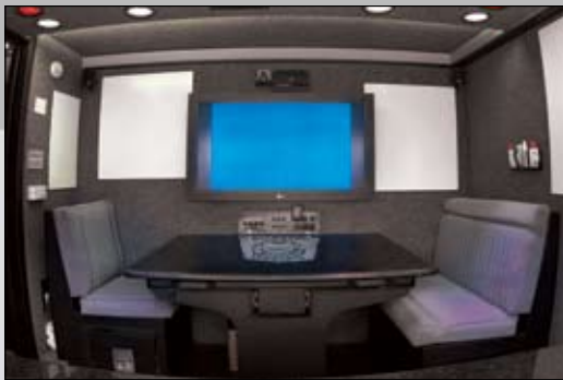
Flat screen communication center.