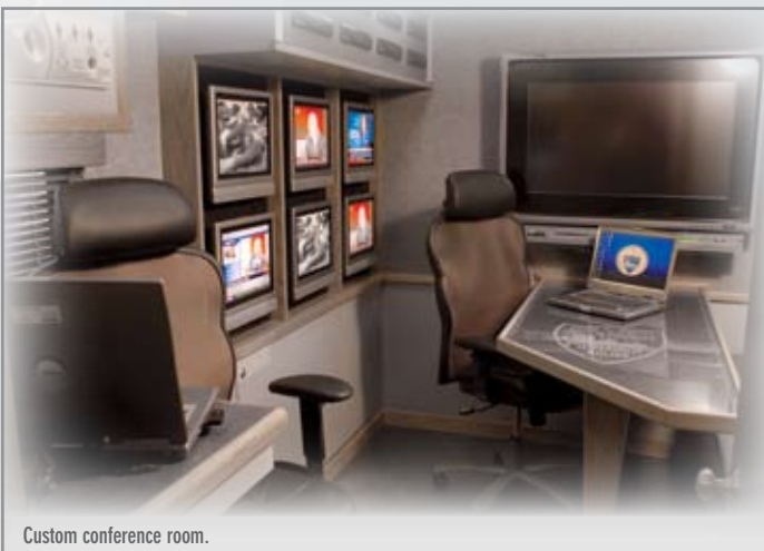
Custom conference room.