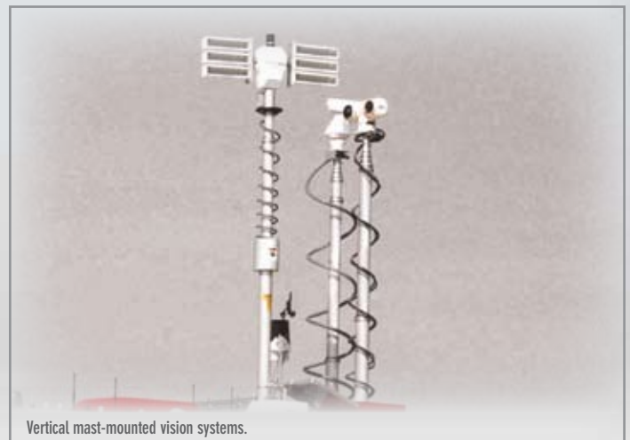
Vertical mast-mounted vision systems.