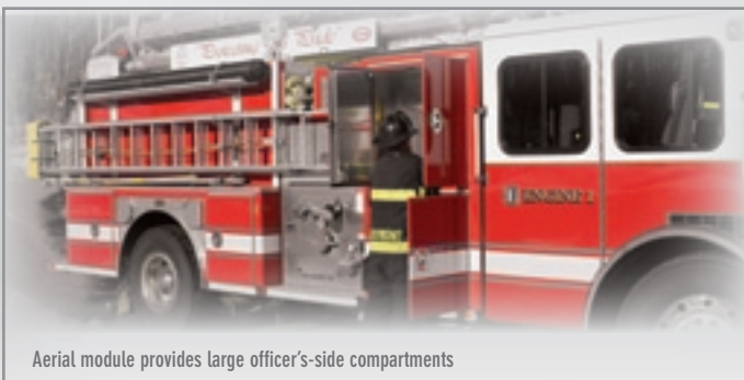
Aerial module provides large officer's-side compartments