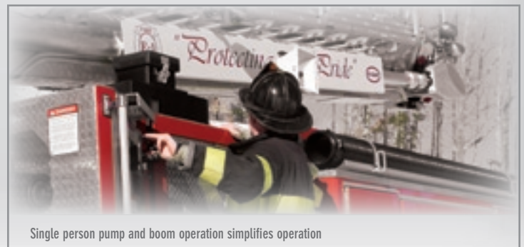
Single person pump and boom operation simplifies operation