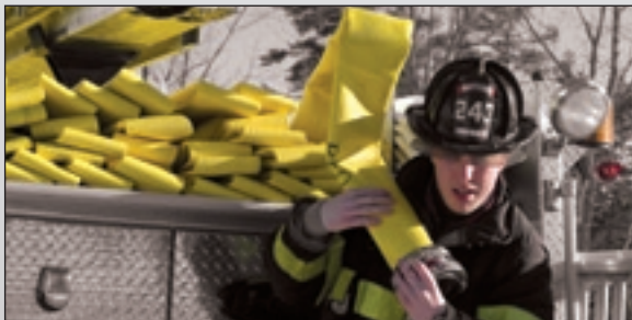
Easy access pumper-style hosebed