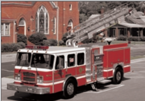
Truly versatile unit offering quick and easy operation